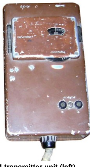
Photos of a well used Belka-4 transmitter unit (left) and receiver unit (right).

© This WftW Volume 4 Supplement is a download from www.wftw.nl. It may be freely copied and distributed, but only in the current form.